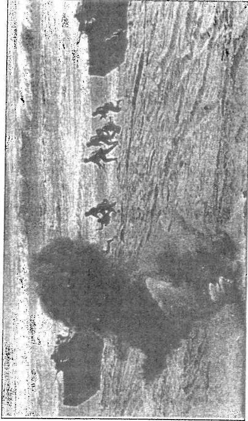
Marines engage in amphibious training exercises at Camp Pendleton in 1989.